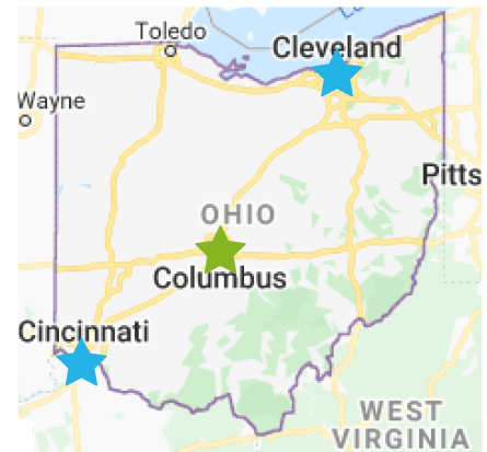
Over 400 Ohio communities have adopted community choice aggregation, including Cleveland and Cincinnati.

The City of Columbus is committed to implementing an electric community choice aggregation program powered by 100% clean, renewable energy. The City of Columbus will place community choice aggregation on the November 3, 2020 ballot. Columbus residents will then have the opportunity to vote on a 100% clean energy community choice aggregation program.