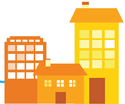
YOUR COMMUNITY CHOICE